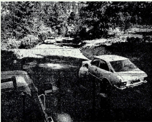
FRANZ VALLEY ROAD WHERE THREE BODIES FOUND Evidence Being Sifted by Investigators Today